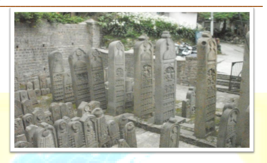
<u>Memorial stones or barsile which were constructed in memory of those queens and the other women of royal family, who became sati in Mandi town.</u>